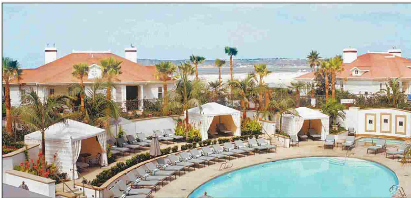
It's as if Miss Havisham slipped out of her faded wedding dress and into an elegant bathing costume – and yes, she's had some work.