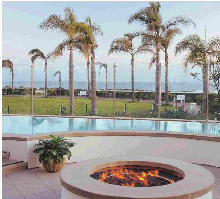
Warming to the view: New fire pits at the Hotel del Coronado, like this one on the spa terrace, entice visitors to linger outside.