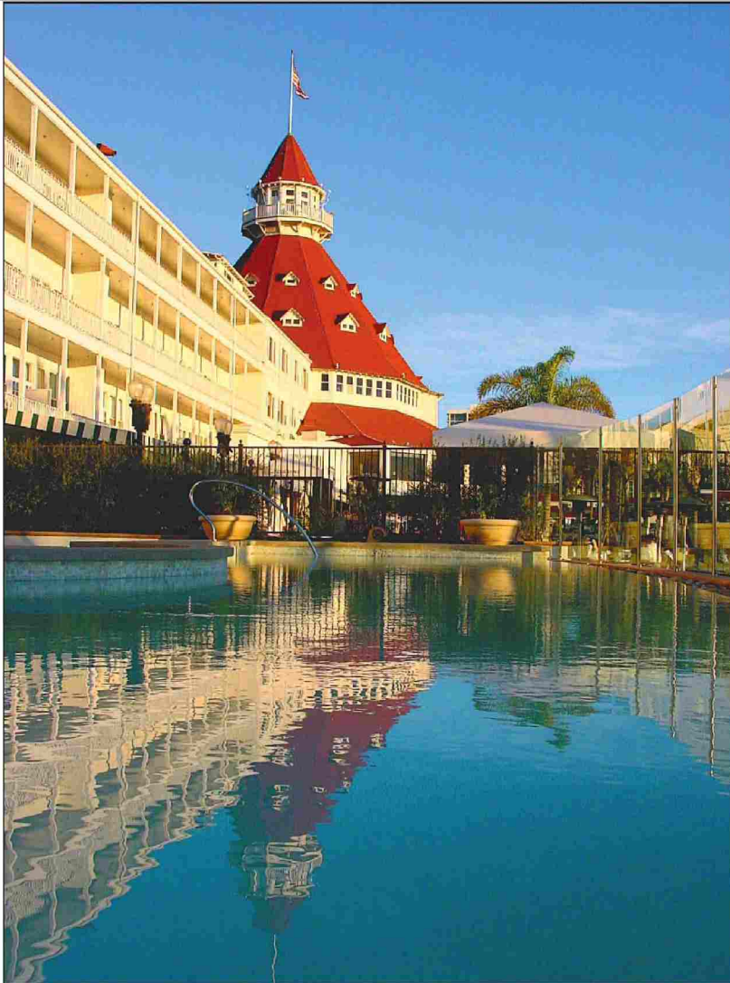
Patrons of the new spa at the Hotel del Coronado can soak in a private pool, above, with a view of the beach. Guests of the hotel's new cottage-style Beach Village have their own pool, below.